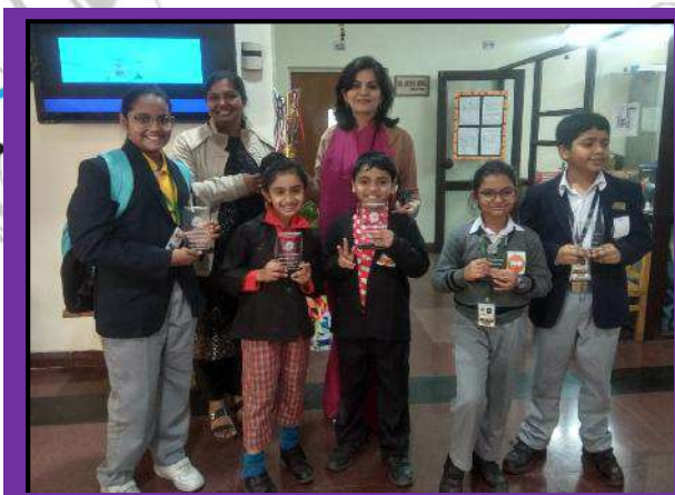
AFFINITY INTER SCHOOL COMPETITION 1 st Position -Word Nerd Poetry in action English Trivia