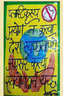
Neelakshi Pal - X A