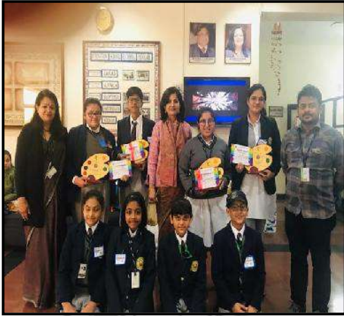
CHITRANKAN (INTER SCHOOL ART FEST) 2 nd Prize- Water colour painting Indian Art drawing. Photo shoot Competition

“WE ARE WHAT WE REPEATEDLY DO. EXCELLENCE, THEN, IS NOT AN ACT, BUT A HABIT.” - ARISTOTLE