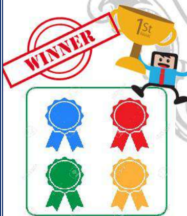
INTER HOUSE RANGOLI COMPETITION 1 st -Pawani House 2 nd - Alaknanda House 3 rd - Bhagirathi House