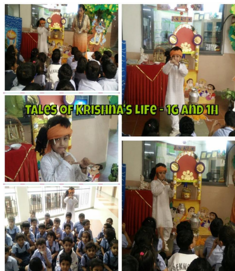
TALES OF KRISHNA'S LIFE - 1G AND 1H