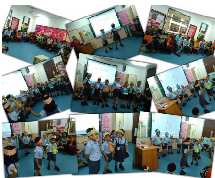
Mathamity Class I D Zero the Hero

Mathamity -display of logic interspersed with other Multiple Intelligences by the Tiny tots of Junior School at Amity 46.