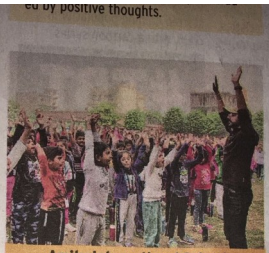
Amity International School