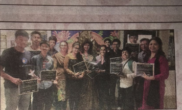
Amity International School, Sector 46, Gurgaon

For more formal occasions can be teamed with blazer to give a semi-casual look.