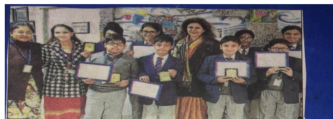
(Left) Winners of Heritage Quiz at Amity International School, Sector 46.