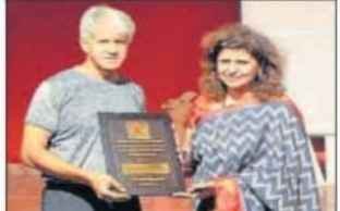
Amity Int'l school discussed 'Disruption' at a TEDx event.