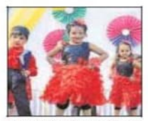
Laxmi Int'l students celebrated the 'Colours of Life'.