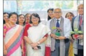
Manav Rachna Int'l hosted an MUN, where students learnt the importance of diplomacy.