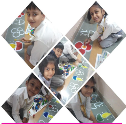
Class 2 I wishes u a smiling DIWALI