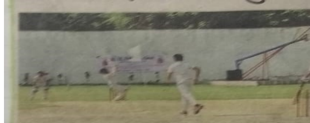
सेक्टर 46 स्थित एमिटी इंटरनेशनल स्कूल में खेले जा रही माइकल मेमोरियल क्रिकेट टूर्नामेंट 2018 में खेले जा रहे मैच का दृश्य - आसरा

आज, शुक्रवार, दिनांक 27 अक्टूबर 2018 को आयोजित एकता दिवस का आयोजन किया गया। इस अवसर पर विचार, कर्म और जीवन की विचार प्रतियोगिताएं आयोजित हुईं।