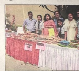
(From left) Lotus Valley International School, Salwan Public School.

LOTUS VALLEY INTERNATIONAL SCHOOL, Lotus Valley International School, Gurugram organised its Annual Event - 'Seva: Mid-Learning and Training for a cause' to create awareness and facilitate the less privileged become integrated independent and inclusive members of the society. 'Seva' as the term indicates is to work selflessly for the society. We at LVS Gurugram firmly believe in the opportunity to give back to the society in our own humble way. Students from Tamara School were an integral part of the Seva. The drawings and decorative items, baked and cooked made by the students of Tamara were the biggest attraction for visitors to the event.