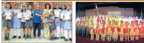
(Left) Amity International School, Sector 46. (Right) Delhi Public School, Sector 45.