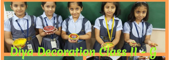
Diya Decoration Class II - G