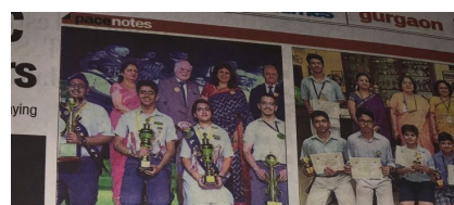
(From left) Amity International School, Sector 46; Blue Bells Model School, Sector 4.