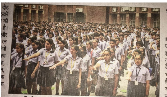
एमटी स्कूल में बच्चों ने प्रेरण के समय पकटा की शपथ ली