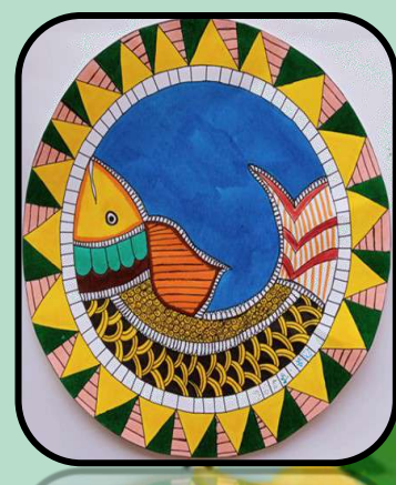
SHASTA GANGOO (CLASS 10)