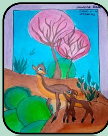
SHWETA DASH (CLASS 6H)