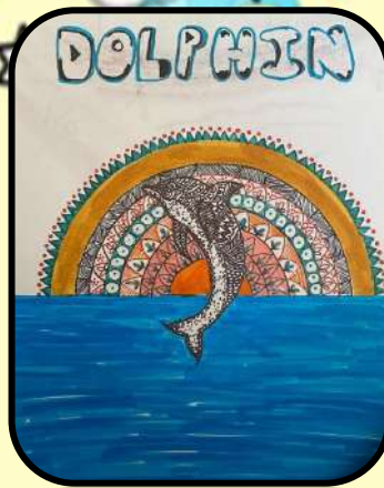
AARNA JAISWAL (CLASS 4C)