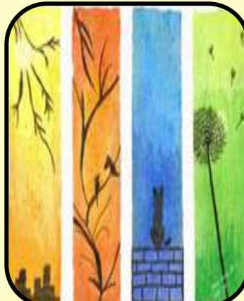
ANAV GARG (CLASS 3J)