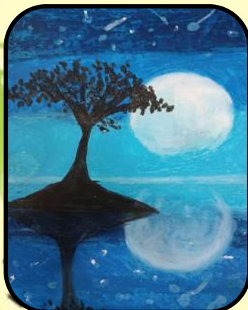
PRITUL AGARWAL (CLASS 4E)