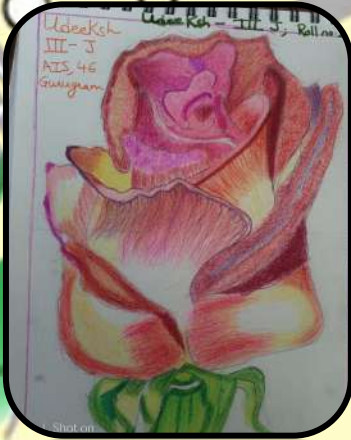
UDEEKSH (CLASS 3J)