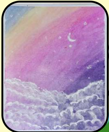
GAURANSHI (CLASS 4F)