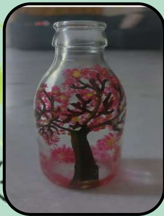
AARNA JAISWAL (CLASS 4C)