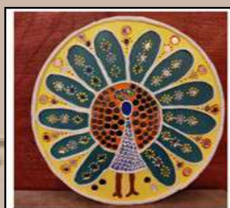
Painting By: Shreya Makhija, 12-F