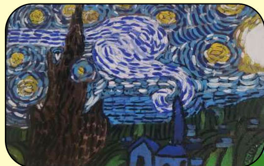
SPRUHA GUPTA (CLASS 4J)