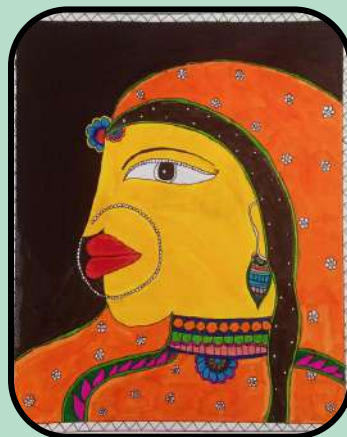
SHASTA GANGOO (CLASS 10)