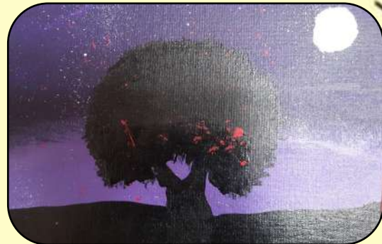
ARJUN ARORA (CLASS 4D)