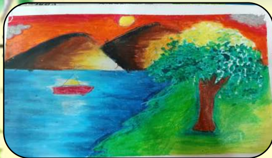
PRITUL AGGARWAL (CLASS 4E)