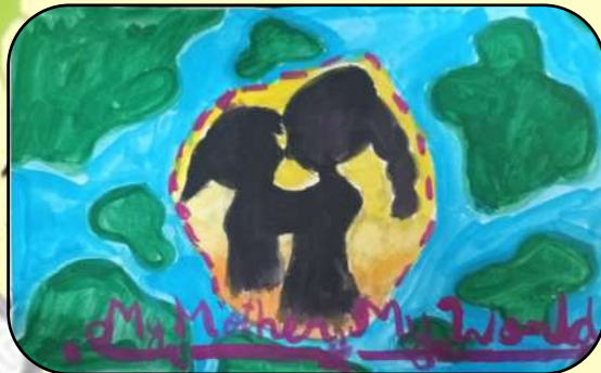
DIYA PARMAR (CLASS 4J)