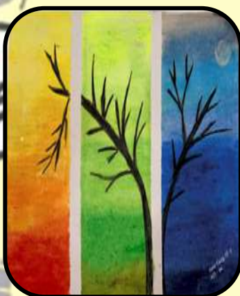
ANAV GARG (CLASS 3J)