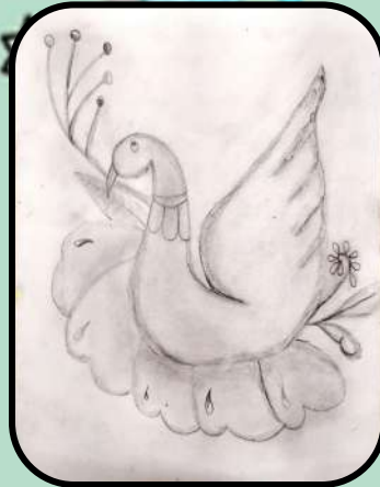
DAKSH PALIWAL (CLASS 5A)