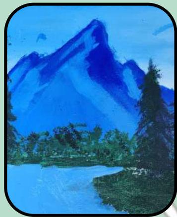
BHAVIKA GUPTA (CLASS 6C)