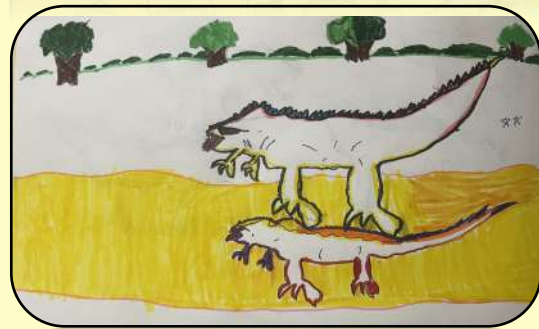
RIDIT MALHOTRA (CLASS 4J)