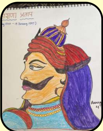
AARNA JAISWAL (CLASS 4C)