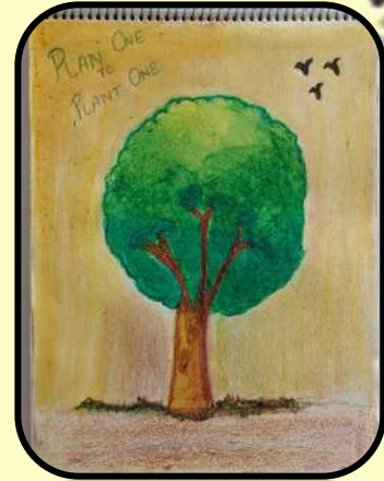
MEDHA AGARWAL (CLASS 4E)