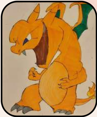
AAROHAN (CLASS 3-E)