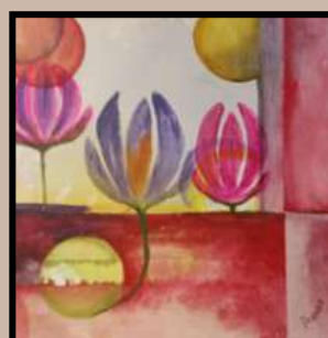
AVANEE BANSAL (CLASS 8-C)