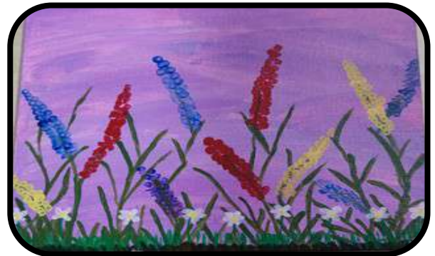
ADHRIT DHINGRA (CLASS 4-F)