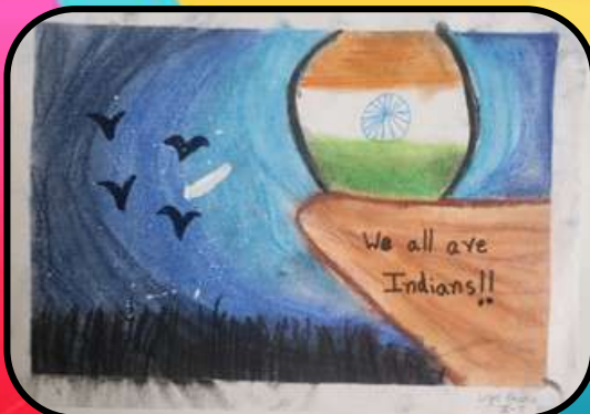
LIVYA (CLASS 3-J)