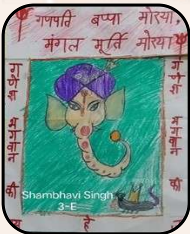
SHAMBHAVI SINGH (CLASS 3-E)