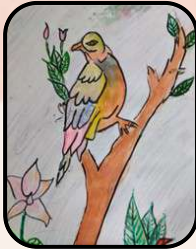
AKSHAJ (CLASS 4-H)