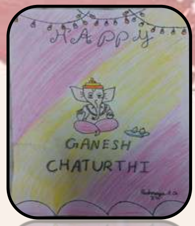
PADAMJA A.G (CLASS 3-J)