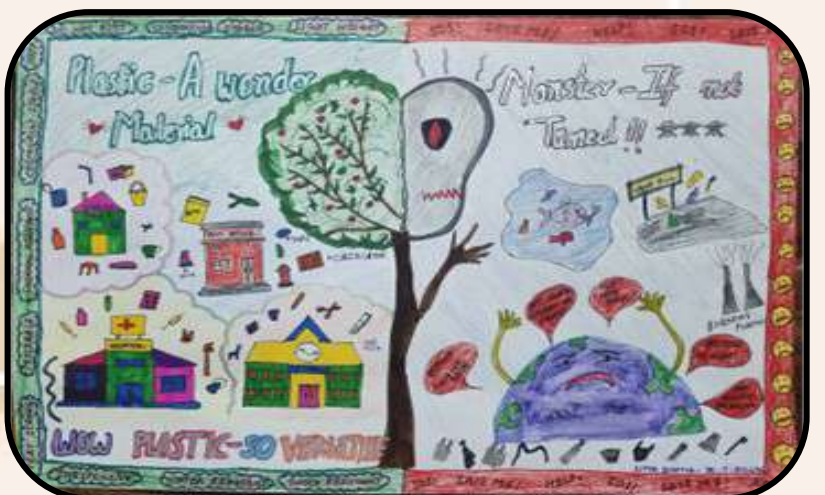
LIVYA (CLASS 3-J)