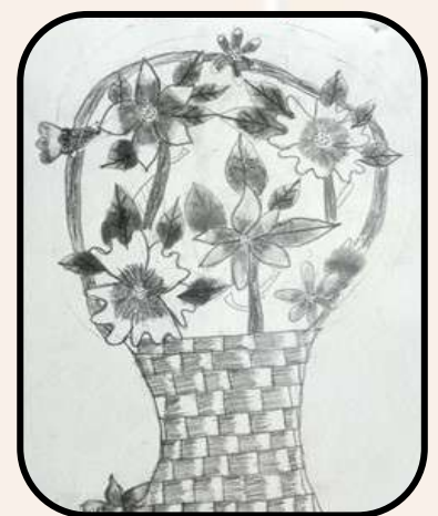
UDDEKSH (CLASS 3-J)