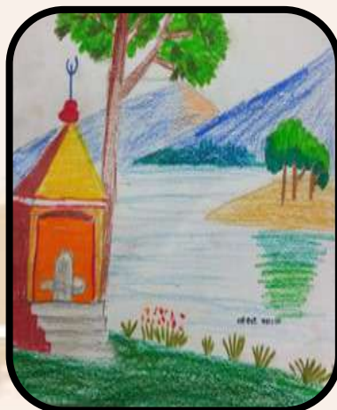
YASHI (CLASS 4-F)