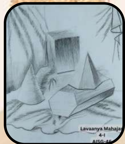
ANAV GARG (CLASS 3-J)