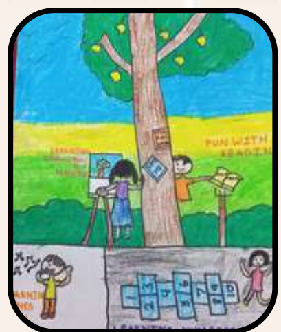
YASHI (CLASS 4-F)