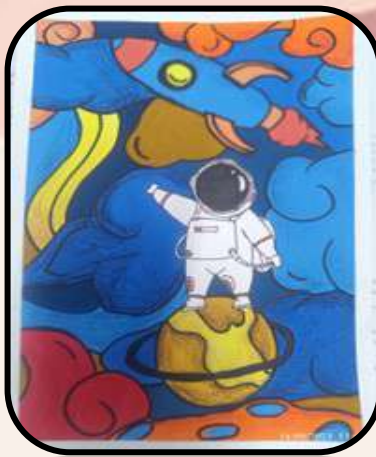
AAHNA SACHDEV (CLASS 3-D)