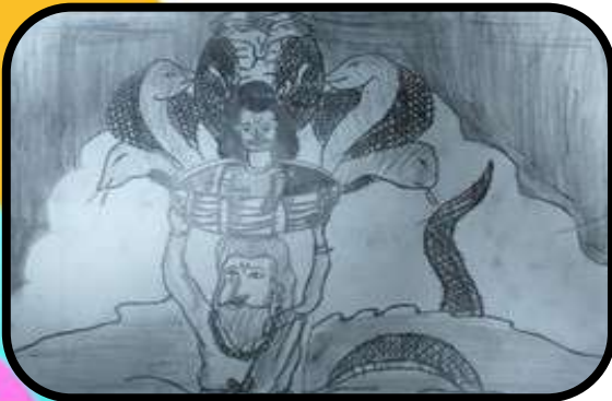
ABHAV NARULA (CLASS 3-I)