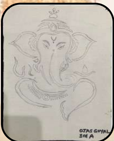
OJAS GOYAL (CLASS 3-A)