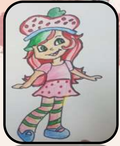
AYUSH NARULA (CLASS 4-C)