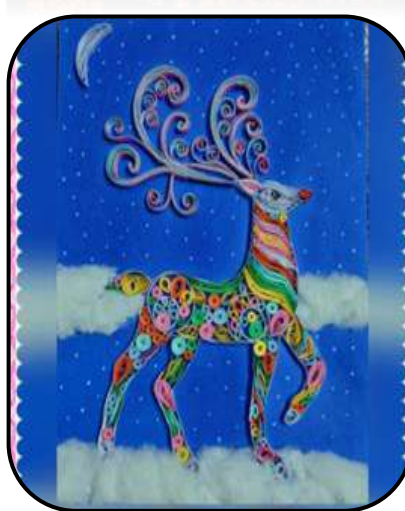
AASHNA BHALLA - VII A