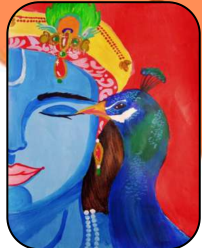
ABHAV NARULA - III i