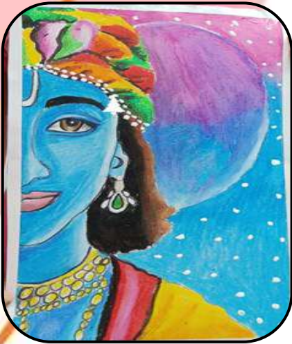
AASHNA BHALLA - VII A