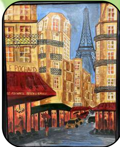
MANYA TINNA - VIII D