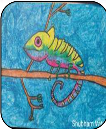
SHUBHAM VATS - VI I