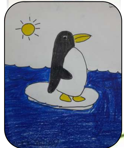
PULKIT YADAV - III I