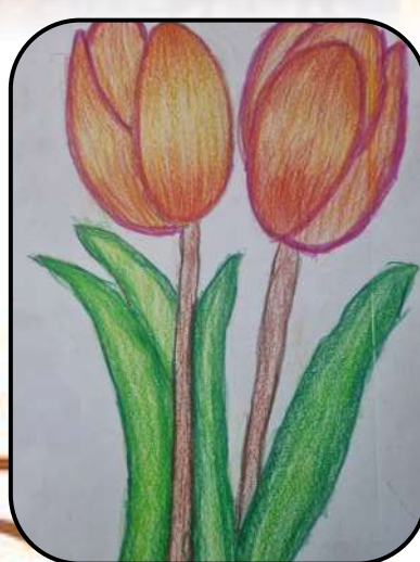
PAAVNI SARASWAT - III H