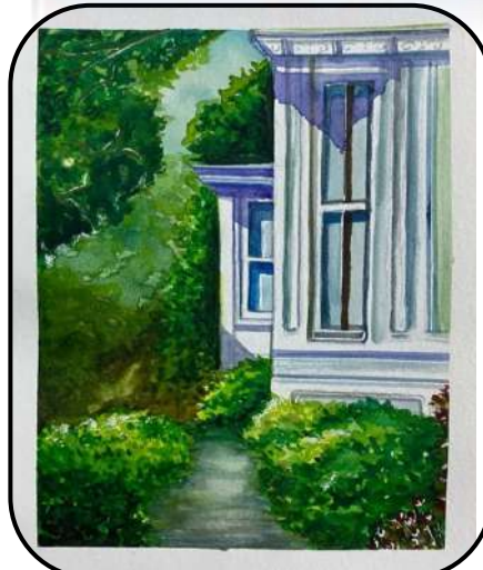
SIA - XII D