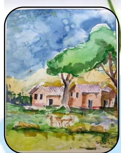
SRISHTI - III D