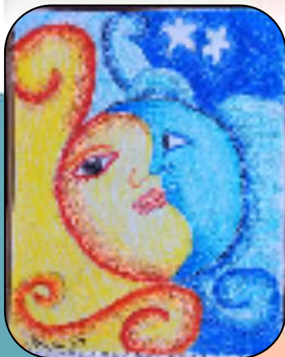
LAKSHYAA - III I