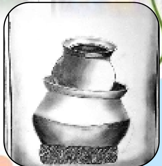
AVANI - XII