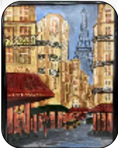
MANYA TINNA - VIII D