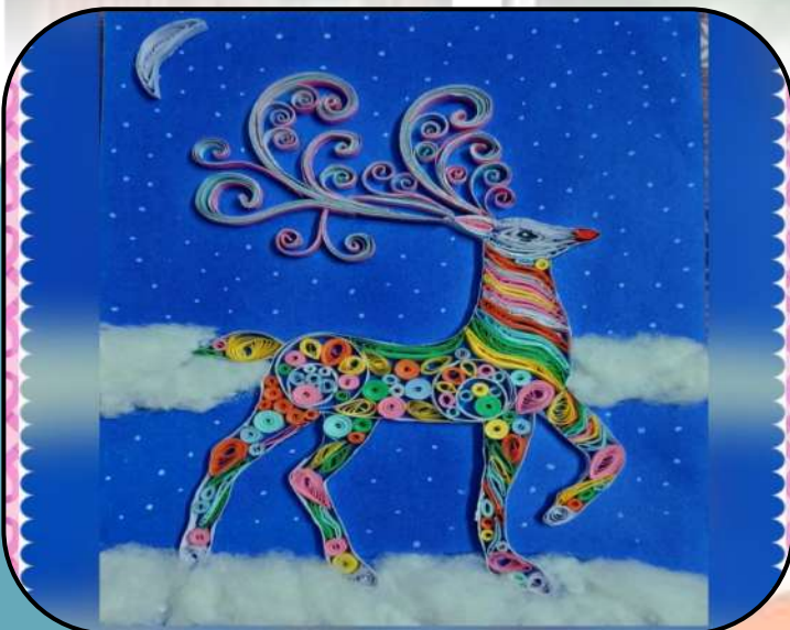
AASHNA BHALLA - VIII A