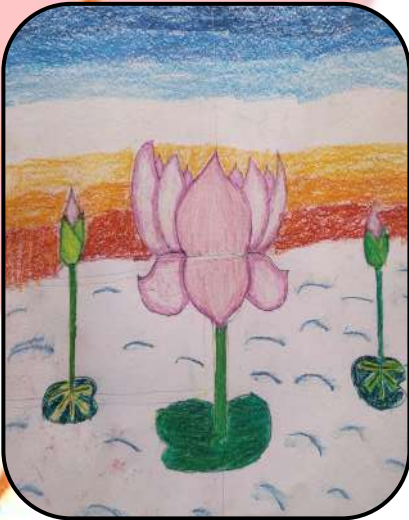
KAYRA PODDER - III H