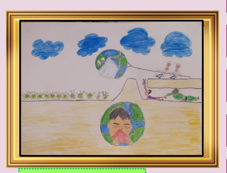
Nikunj Bansal, V-A