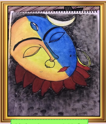
Akshit Agrawal, V-C