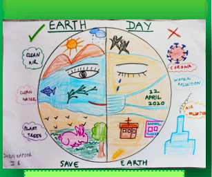
Dhruv Kapoor, II-B