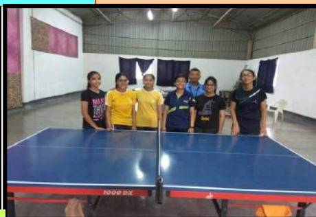
Table Tennis Senior Girls Team Stood Second In Zonal Tournament 2018