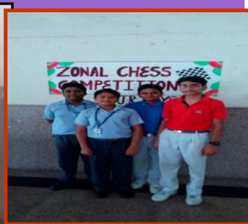
Jr. Boys team got first position in zone 2, East Delhi Chess tournament organized by the DOE, held at Govt Sr. Sec. School,