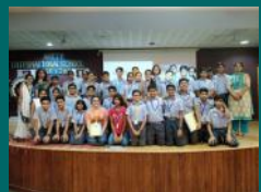
Assembly By VIII B Friendship Day