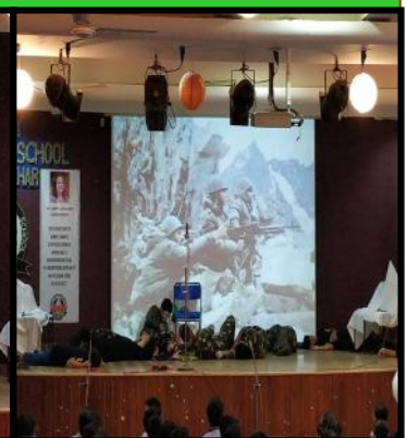
Special Assembly On Kargil Day