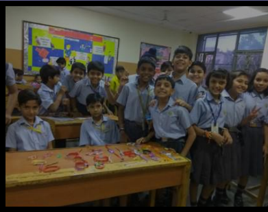
Friendshipband making Classes I to V