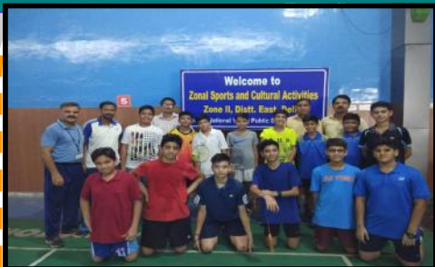
Sub Junior boys Badminton team scored second position in the zonal competition