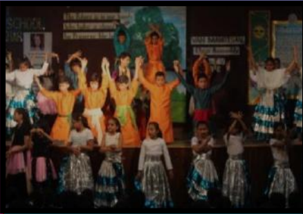
Assembly By Class V