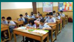
Friendship Band Making By Classes I to V