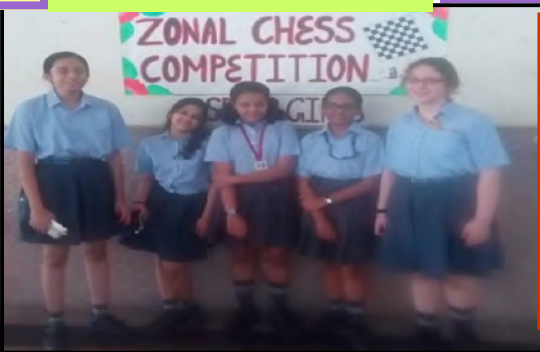
Jr. Girls team got the first position in zone 2, East Delhi chess tournament organized by the DOE. Delhi