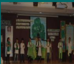
Assembly Van Mahotsava