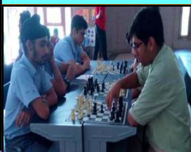
Sr.Boys team got first position in zone 2, East Delhi Chess tournament organised by the DOE, Delhi