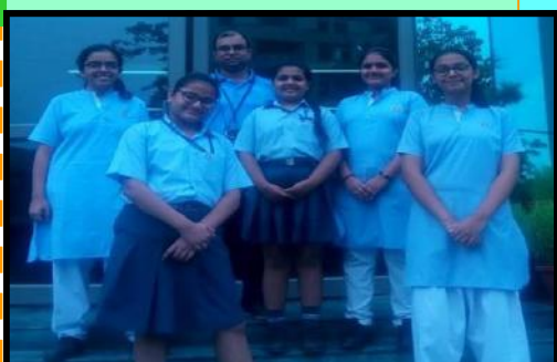
Sr.Girls team got the second position in zone 2, East Delhi Chess tournament organised by the DOE, Delhi