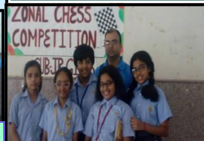
Sub Jr.Girls team got the first position in zone 2, East Delhi Chess tournament organized by the DOE, Delhi