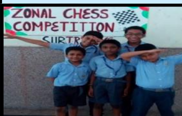
Sub Jr.Boys team got the first position in zone 2, East Delhi Chess tournament organized by the DOE, Delhi