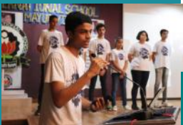
Opening Ceremony Cybercon