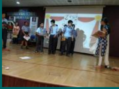
Assembly By VIII B Friendship Day