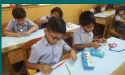
Friendship Band Making By Classes I to V