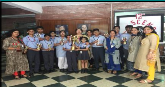
Outstanding performance by students at Robotronics :Overall rolling trophy