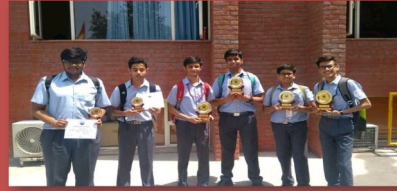
Unplugged Cyber Competition at Khaitan School Noida