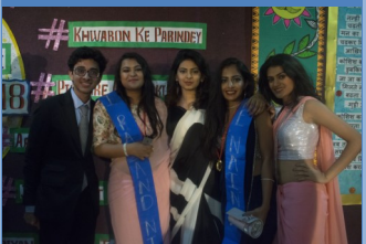
The outgoing batch making the memories.