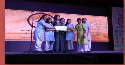
Consolation Prize at National Convention For Khadi- Adi Sangam 2018