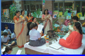
The day begin with auspicious Havan.