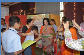
Ma'am being presented with the self-composed poems by students.