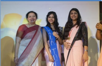
The beautiful damsels posing after winning the titles.