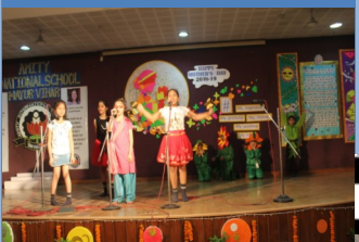
Regaling their mothers with their performances.