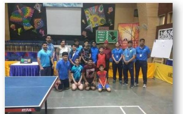
1st position in Inter Amity Table Tennis Tournament at Amity Vasundhara 1