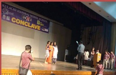
German competition at Kulachi Hansraj Model School