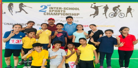
2nd inter school Athletic Meet held at Salwan public school