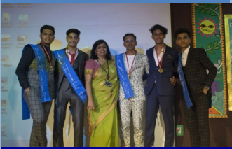
The young guns posing after getting the titles.

The euphoria came to a halt as the tribute video came into play. Nostalgia took the spotlight with the soon-to-be-alumni reminiscing about the good old days. Needless to say, teary eyes were witnessed in large numbers. The glamorous Farewell 2018 came to an end with the cutting of the mouth-watering cake. Who, after all, said that endings can't be sweet?