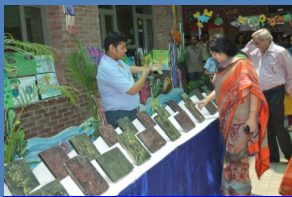
Taking stock of the exhibition put up by the students.