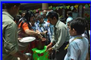
Chairperson ma'am planting Tulsi sapling in the campus.