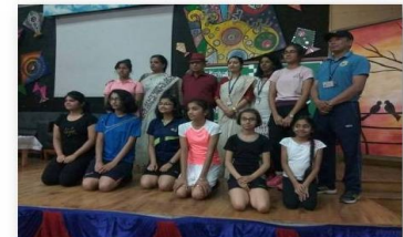
2nd position in Inter Amity Table Tennis Tournament at Amity Vasundhara 1