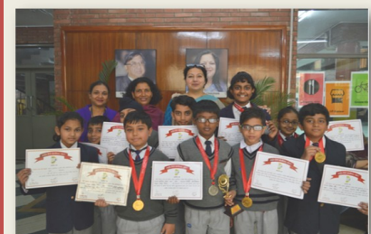
Our students bagged medals in National Hindi Olympiad