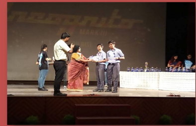
INCOGNITO at Somerville school, Noida