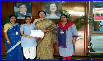
Korea-India Painting competition