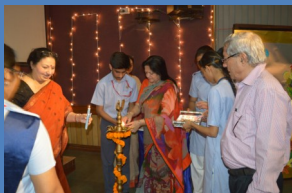
Chairperson ma'am lighting the lamp