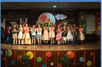
The tiny tots performing for their mothers.