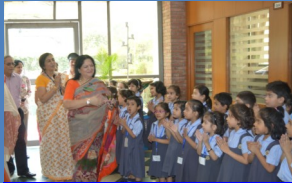
Chairperson ma'am being greeted by the tiny tots