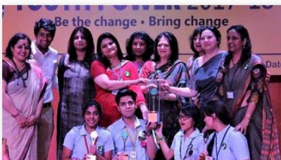
1st position in YOUTH POWER