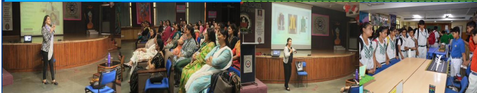
Grooming Workshop for Teachers