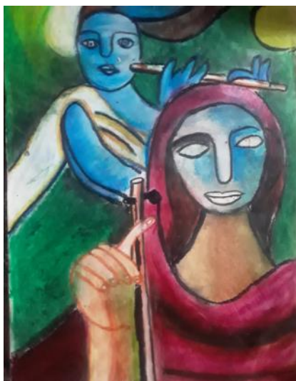
Akshit Aggarwal 4 C