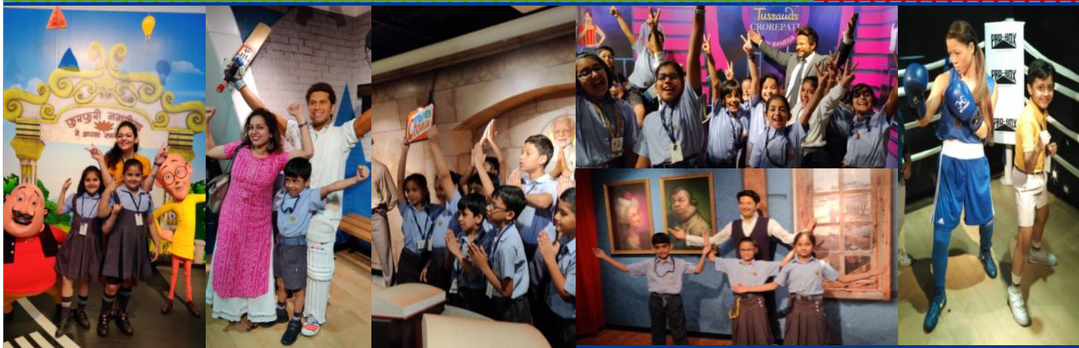
Picnic to Madame Tussauds for classes II - IV