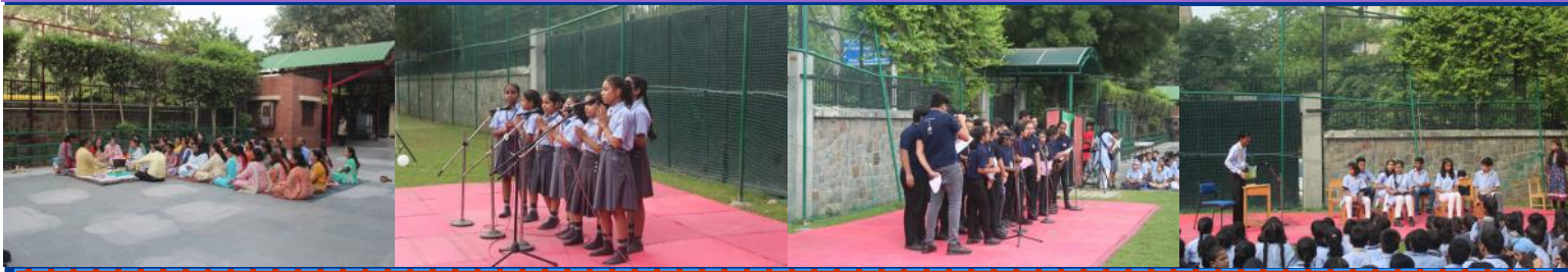
Teacher's Day Celebration 2019