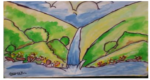
Sanyam Jain 9 D