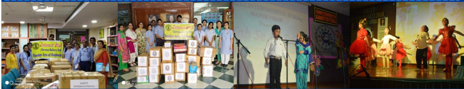
Interact Club organizes Assam Donation Flood Drive