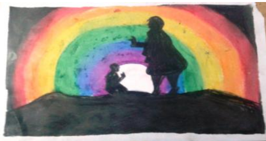
Chhavi Gautam 7 C