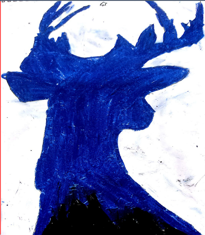
By Eesh Saini Class IV C