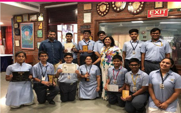
MUN team with their awards