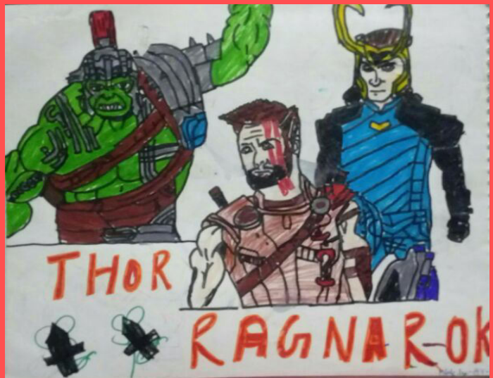
By Ayush Singh Class V B