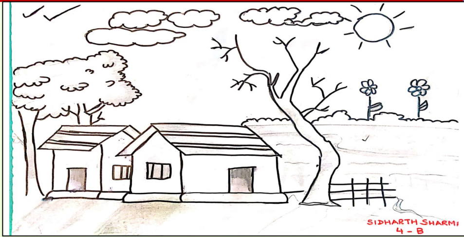
SIDHARTH SHARMA 4 - B