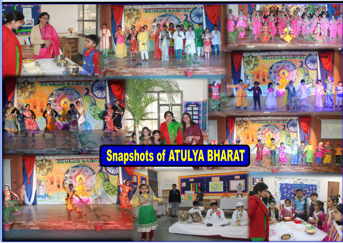
Snapshots of ATULYA BHARAT