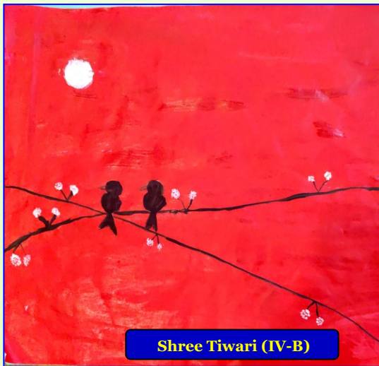
Shree Tiwari (IV-B)