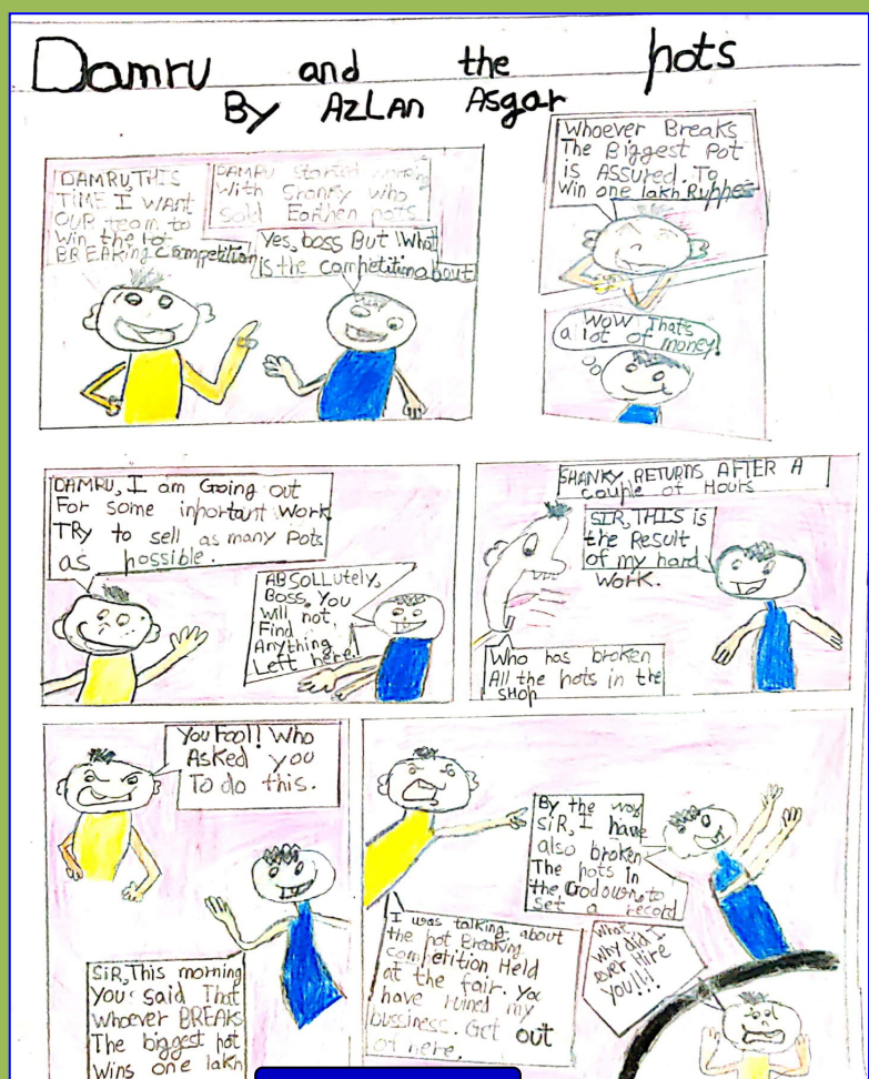
Azlan Asgar (IV B)